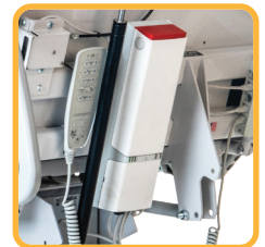
On-Board Charging Lithium-ion Battery