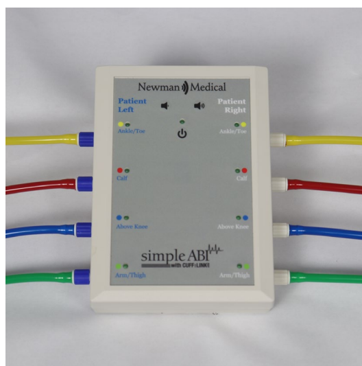
Cuff-Link Control Unit with tubing properly attached