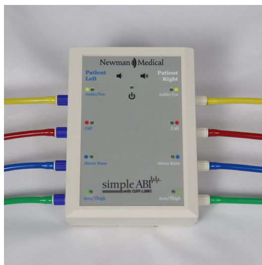
Cuff-Link Control Unit with tubing properly attached