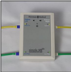
Cuff-Link Control Unit with tubing properly attached