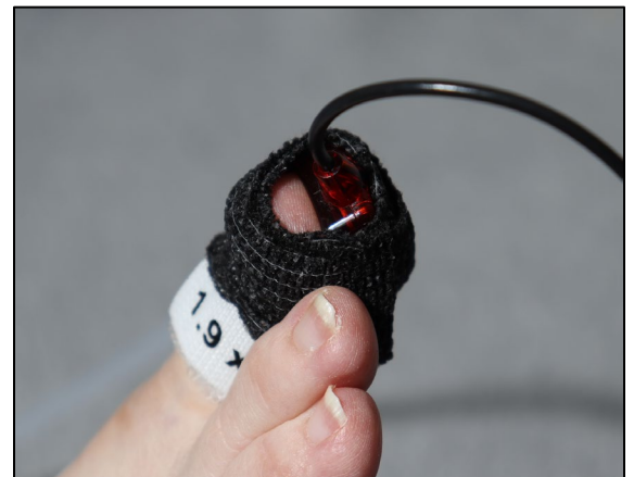
PPG & cuff on Toe