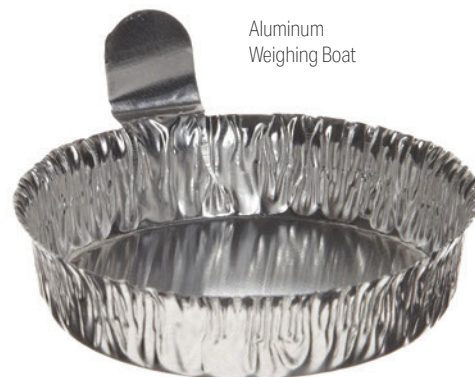
Aluminum Weighing Boat