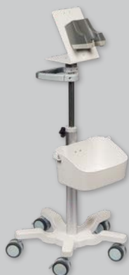
Roll Stand (STND-131)