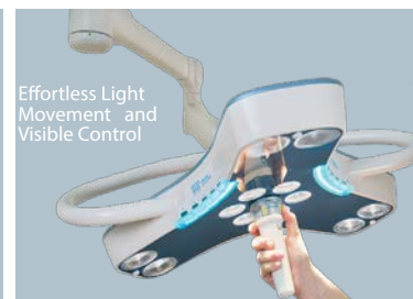
Effortless Light Movement and Visible Control