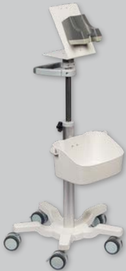
Roll Stand (STND-111)