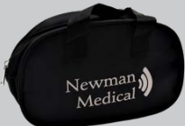
Carry Bag (ACC-170)