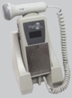
Recharging Wall/Table Base (ACC-111)