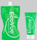
Ultrasound Gel 8.8oz | 2.1oz (GEL-110) (GEL-100)