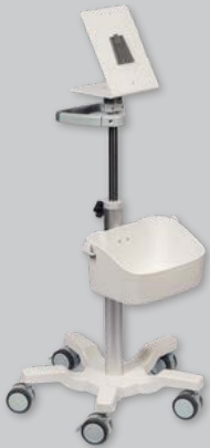
Roll Stand (STND-150)