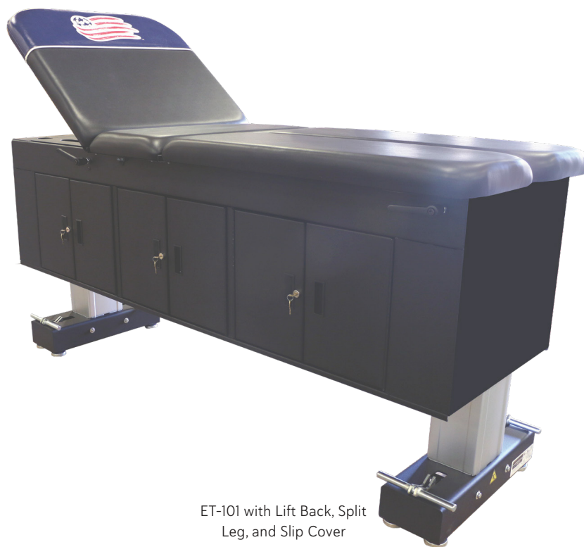
ET-101 with Lift Back, Split Leg, and Slip Cover