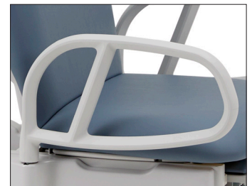
ComfortGrip™ Patient Assist Handles