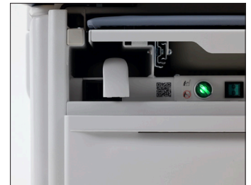
EasyGlide™ Mobility System