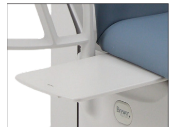
Mayo Pass-Through Work Surface