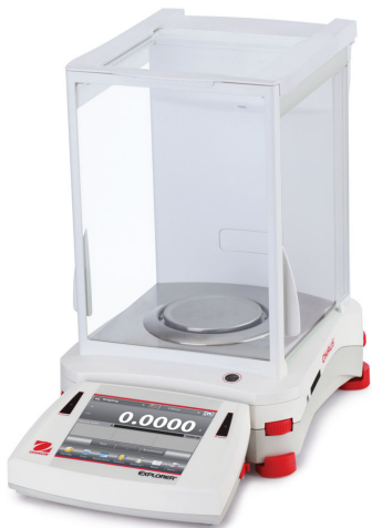
EX224Ny, EX324Ny, EX223Ny EX423N, EX1103N