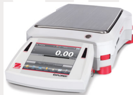
EX2202Ny, EX4202Ny, EX6202Ny EX6201Ny, EX10201N, EX10202Ny