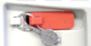
Locked with Wire Seal