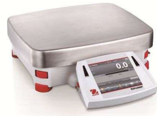
EX12001N, EX24001N, EX35001N