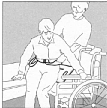
4. A weak and partially active patient may need assistance