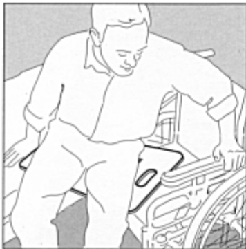
3. An active patient may be able to manage on his/her own

During patient transfer from a bed to a wheelchair, it is often advantageous to position the wheelchair at a slight angle to the bed so that the rear wheel of the wheelchair is not in the way of the patient transfer. It is better if the bed is a little higher than the wheelchair to allow for a downward transfer. The most common procedure is for the patient to be transferred to sit on the edge of the bed and then slide across to the wheelchair on the SafetySure Patient Transfer Board (fig. 3-4).