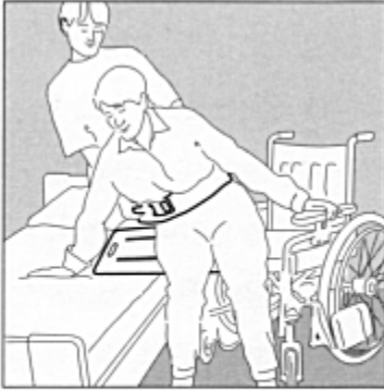
6. A light and partially active patient also wearing a SST Belt

Patient transfers from the wheelchair to the bed often involve an upward movement if the bed cannot be lowered. In this instance, the patient transfer can be made easier by the use of a SafetySure Patient Transfer Belt (fig. 6-7).