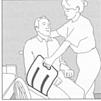
2. Remove by pulling upward