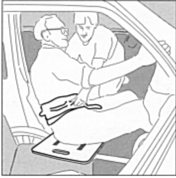
10. A light and active patient