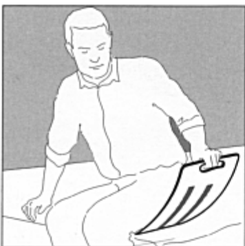
5. A user removes the SST Board unassisted