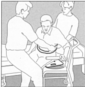
9. A heavy and passive patient may require two helpers. The first helper lifts and guides the patient, while the second helper pulls upon the SST Belt to transfer the patient to the bed.