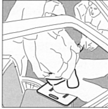
11. Transferring a passive patient into a car using both a SST Belt, a SST Sling and a SST Board