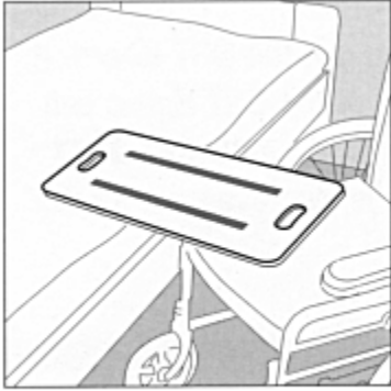
1. Place the SST Board diagonally in front of the wheel

Place the SafetySure Transfer Board under one hip on the individual to be transferred. Tilt the individual towards the SafetySure Transfer Board, taking the weight of the other hip. With the individual entire weight now resting on the board, the individual can easily be transferred. To remove, bend the patient transfer board upward toward the individual (fig. 2) and slide the board from underneath the patient.