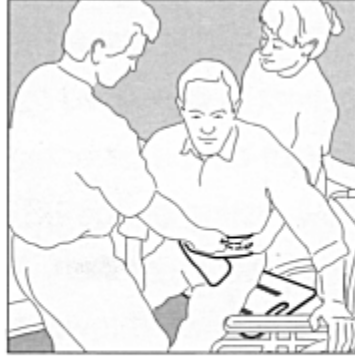
7. A weak and heavy patient may require the use of two SafetySure products: a SST Board and a SST Belt