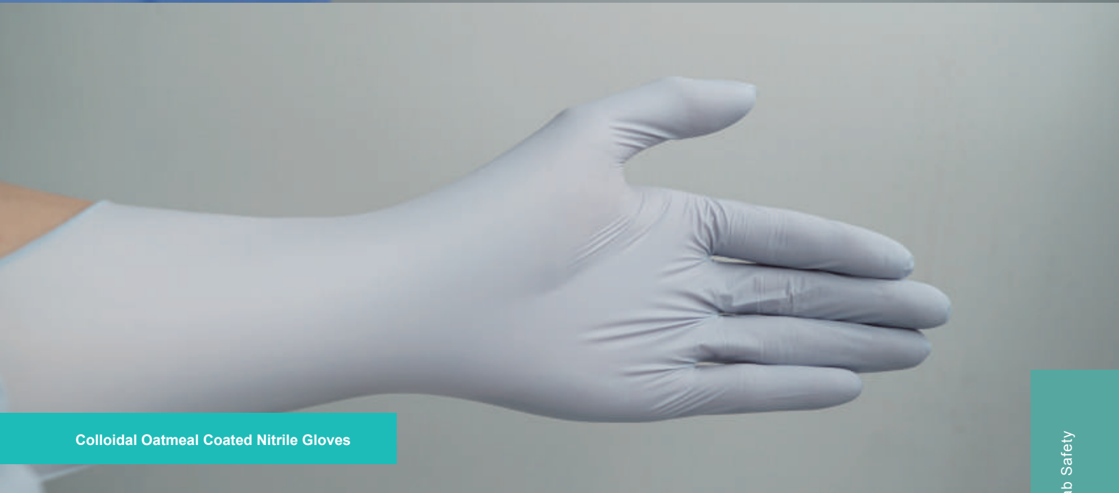
Colloidal Oatmeal Coated Nitrile Gloves