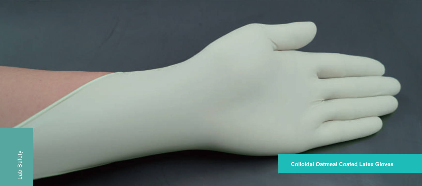
Colloidal Oatmeal Coated Latex Gloves