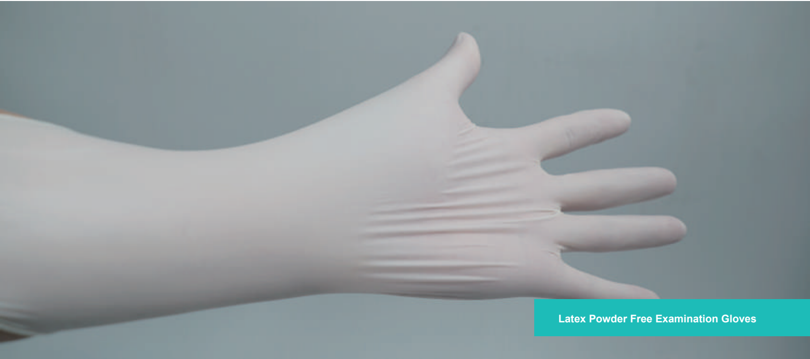
Latex Powder Free Examination Gloves