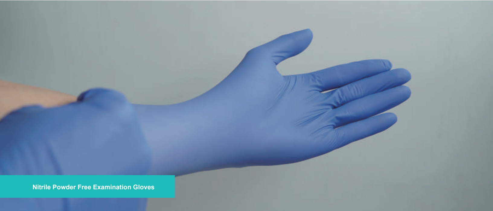
Nitrile Powder Free Examination Gloves