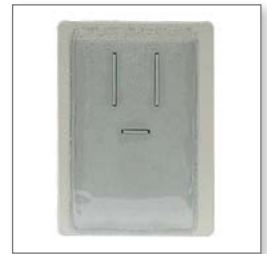
MSCATH-LBL Catheter Slide Label Envelope (pack of 10)