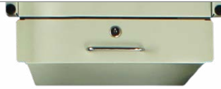
MS-DRW3K-1COL (1 column, 1 drawer) MS-2DRW3K-2COL (2 column, 2 drawers) MS-DRW3K-2COL (2 column, 1 drawer) Internal Drawer, Comes with Key Lock or E-Lock