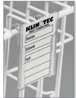
MSLBL-4 Label holder for basket (sold individually)