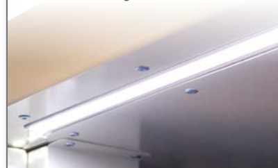
LED Light Kit, Door Sensor and Dimmer for hinged doors