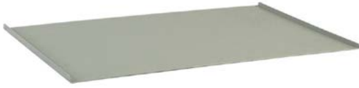
MS-SH1-24 Shelf for single column MedStor Max with 2 adjustable dividers