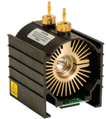
Xenon Replacement Lamp Module for Xenalux