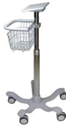
Optional mobile Floor Stand offers vertical support