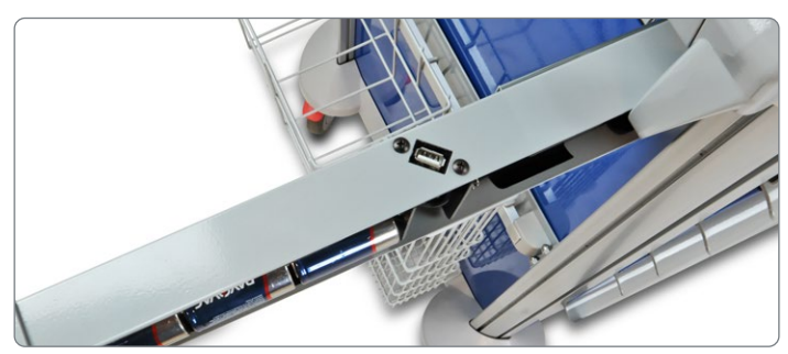
Slideout USB port for field software updates for onboard electronics.