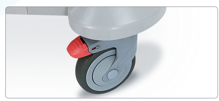
Four bumpers and 5-in-diameter 1 or 2 wheel casters with features such as anti-static, total lock, and bead chain for static disipation. Tente optional.

Seamless side panels without exposed holes provide more hygienic clean-up and flush clean lines for a more aesthetic appearance.