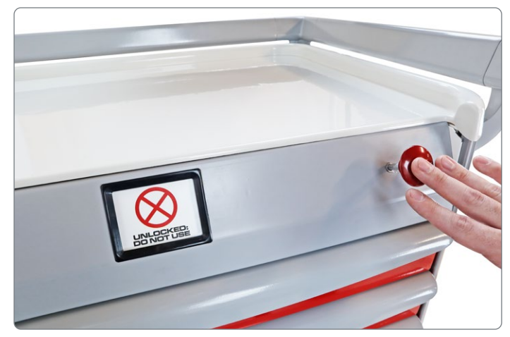
Pressing the Quick Release button instantly unlocks all drawers and the flag changes to red.