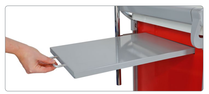
Soft-close side extension trays on each end provide additional pull-out counter space.