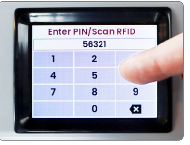
Touchscreen LCD for entering pincodes