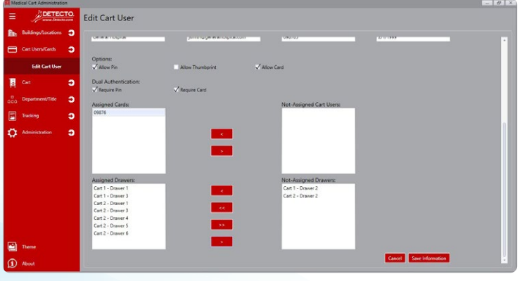
You can easily select which individual drawers users have access to if your cart has individual drawer locking.

Easily add new carts with up to 3 admins each for text and e-mail notifications.