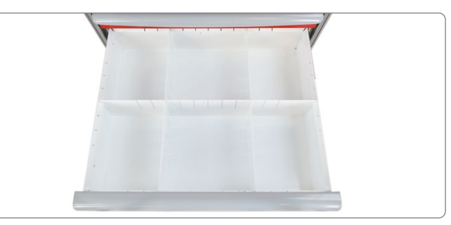
Roomy drawers maximize storage space with infinite combinations available in 3, 6, 9, and 12 inch drawer heights in 16.5, 23, and 29 inch widths.

ABS thermoplastic countertop with molded edges that is all one continuous piece for optimal hygienic clean-up.