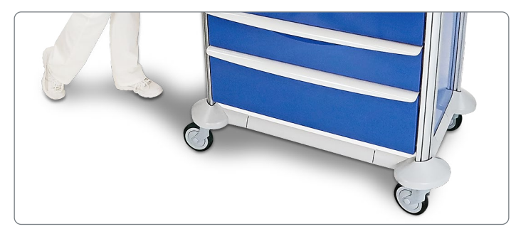
DETECTO MobileCare carts offer easy mobility for smooth transport and nimble maneuvering.