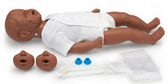
The Pediatric CPR Manikins come fully assembled and ready to use.