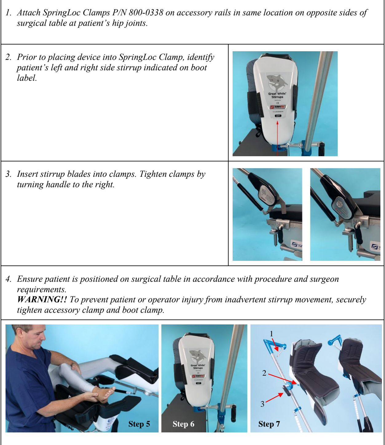
(1) Trigger Handle (2) Free Floating Boot Pivot (3) Boot Clamp

Become familiar with patient positioning device's features before use with patient. Always practice on a nurse, physician or appropriate volunteer prior to using clinically.