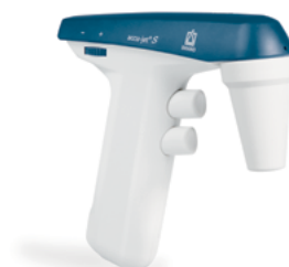
accu-jet® S, petrol