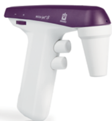
accu-jet® S, berry