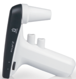
accu-jet® S, anthracite