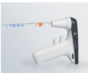
Rest position with inserted pipette

The battery is fully charged in just 4 hours. Working during the charging process is also possible with the charging cable connected.