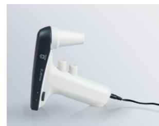
Smart charging technology prevents lazy battery effect