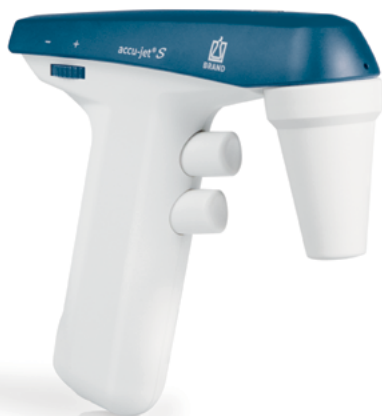
accu-jet® S, color: petrol

Precise pipetting of large and small volumes is simple due to single-handed control of pipetting speed for fast, powerful aspiration, accurate meniscus setting, or precise dispensing of small volumes. Thanks to the precise control, you always achieve the required volume spot-on when working with graduated or bulb pipettes. If you need extra power or precision, motor speed is controlled on the fly with one hand. Choose between gravity-delivery (for pipettes calibrated "to deliver") or powered blow-out delivery (for pipettes calibrated "to contain").