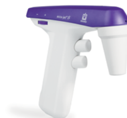
accu-jet® S, amethyst