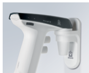
Wall mount for space-saving storage