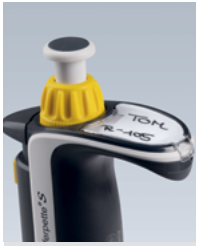
Label on the finger rest

Set the volume, pipette, and eject the tip - all without changing your grip