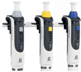
Color-coded for easy volume selection

Secures the set volume from accidental adjustment