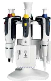
Benchtop rack for 6 Transferpette® S single- or multi-channel pipettes.