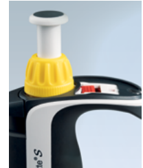
Easy Calibration™ technology

Provides a comfortable and secure fit in all hands – right, left, big or small