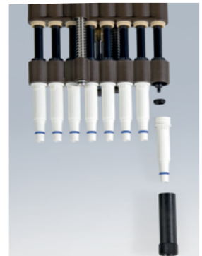
Individually removable nose cones