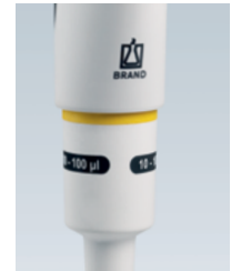
Integrated shaft coupling