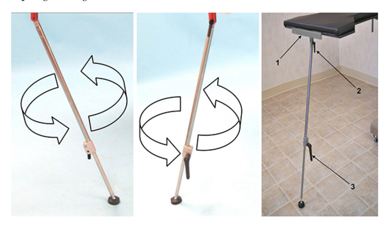
(1) End Rail • (2) Adjustable Swivel Leg Locking Handle • (3) Adjustable Height Locking Handle