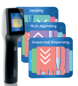
Expanded functionality on the HandyStep® touch S:

The clearly structured menus make fast work with intuitive operation possible, while the most important functions and parameters are always in view.