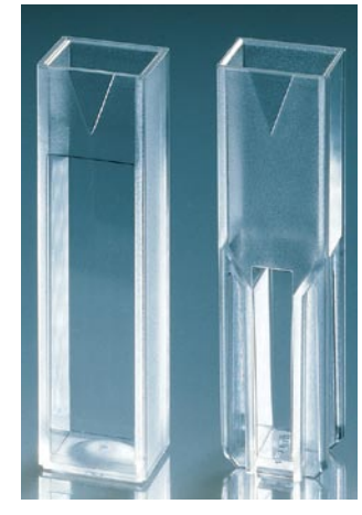
BRAND disposable cuvettes